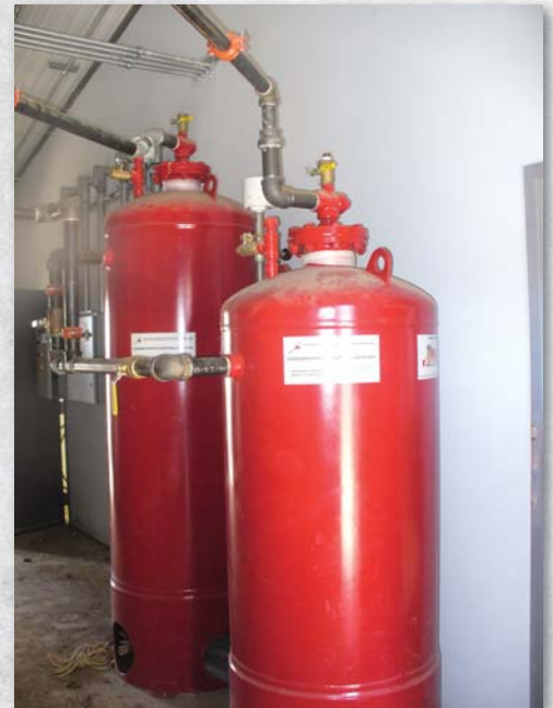
Bladder Tank Concentrate Control System

Custom configurations available upon request