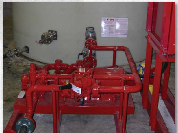
Balanced Pressure Pump Concentrate Control System